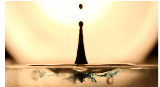
Drop impact flow components: splash with ejected drop, cavity and crown remnants, ligaments (loops), capillary waves