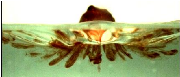
Inclined fiber loops under the primary cavity of a drop impact with chemical reaction (Doklady RAS, 2021, 66(10))